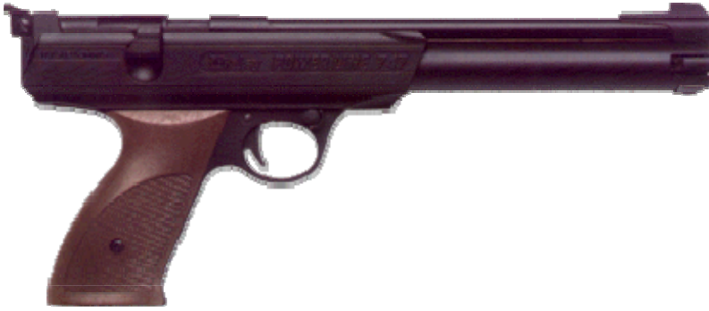
Daisy Avanti 747 single pump pneumatic

Let me start with the pistols, there is a wide range of pistols from the cheapest pump and Co2 pistols to the highest dollar compressed air pistols (mostly used for 10 meter Olympic style shooting, but that's another style of shooting). Some of the more common ones are: