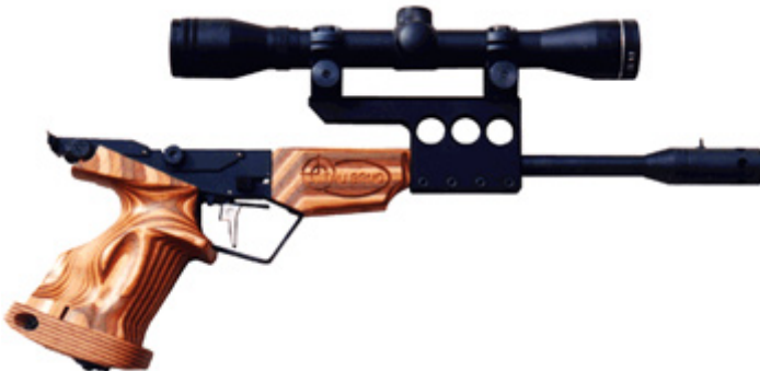
Tau 7 Co2 pistol