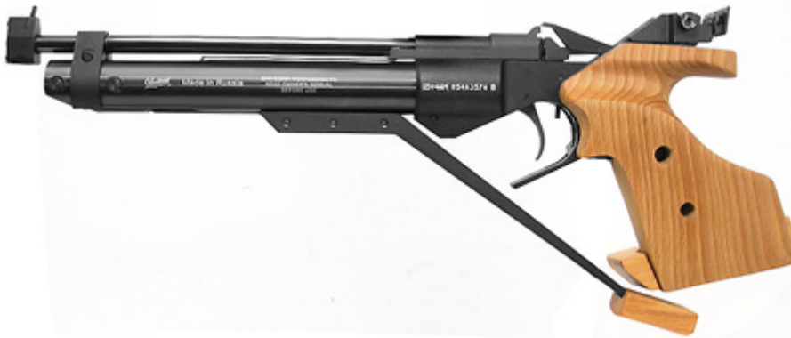
IZH-46m single pump pneumatic